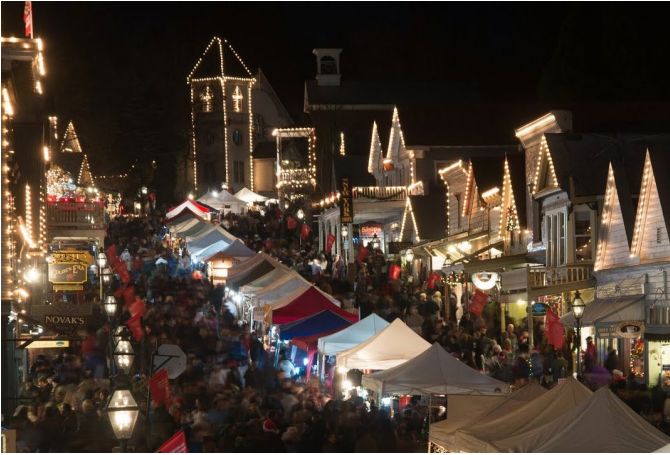
Photo caption: The Grass Valley "Cornish Christmas" is held on Friday nights, November 29, December 6, 13, and 20, from 6:00 - 9:00 pm.; The Nevada City "Victorian Christmas", is held on Sundays, December 8, 15, and 22 from 1:30 - 6:00 pm; and, Wednesdays, December 11 and 18 from 5:00 - 9:00 pm.