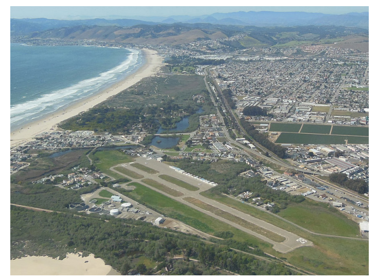
Airport runway from the South