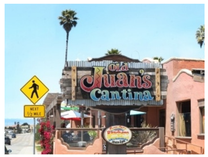
Old Juan's Cantina on Pier Avenue, Oceano, California