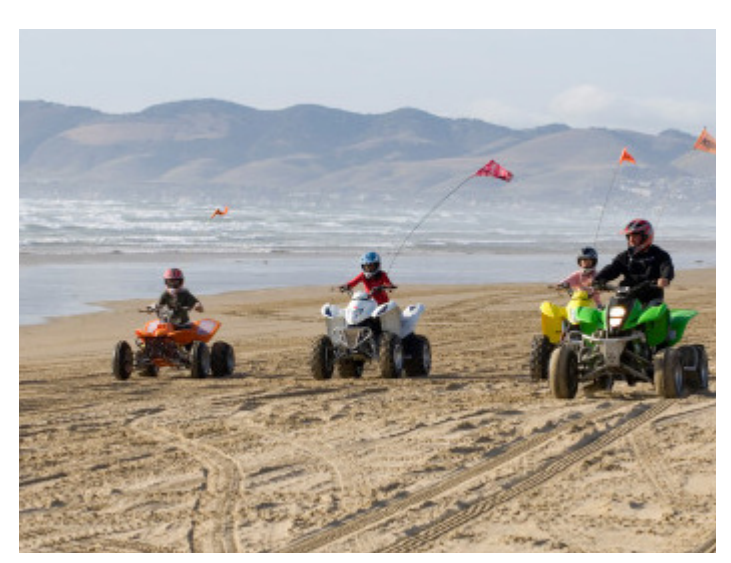
Oceano Dunes is a haven for ATV enthusiasts