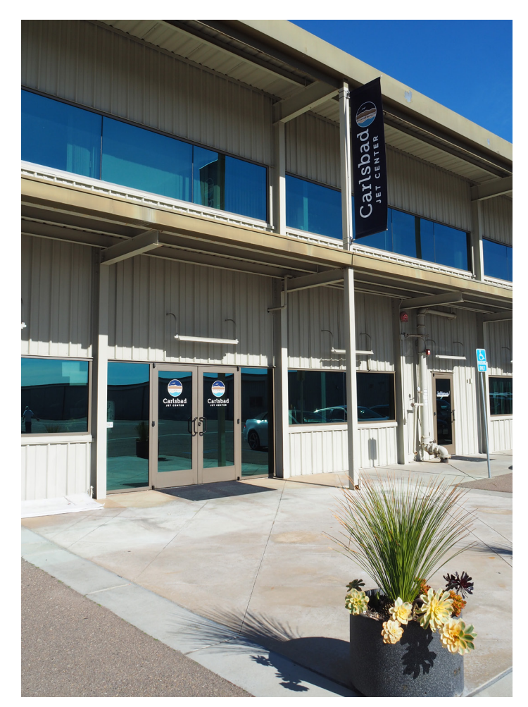
Carlsbad Jet Center, McClellan-Palomar Airport

Furthermore, the FBO's new operator plans to finish construction on the long-awaited FBO terminal. Toward this end, Carlsbad Jet Center has already retained key personnel to see the development through to completion.