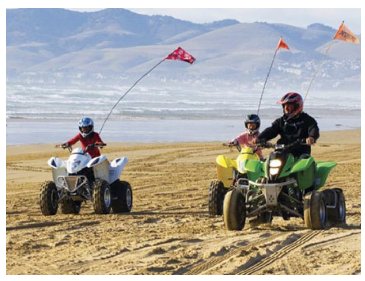
Pismo Beach dune recreation