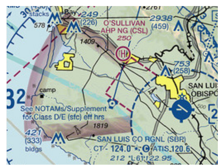
SkyVector aeronautical chart