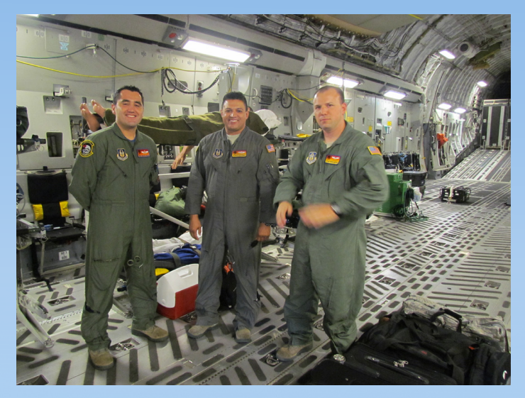
Take a tour of the inside of the USAF Globemaster III and meet the flight crew.