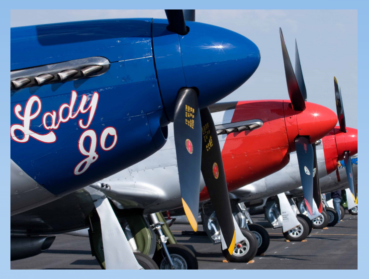
See vintage military warbirds up close and see them fly during the air show.