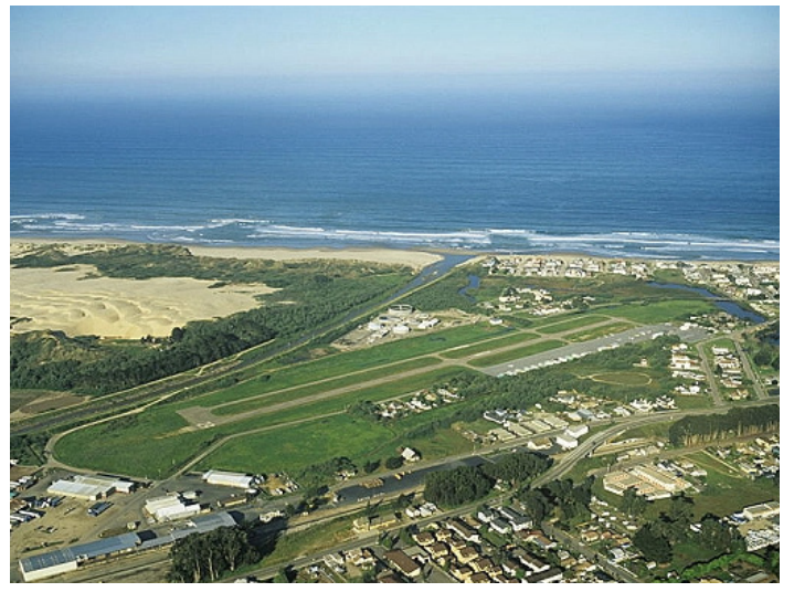
Aerial view of Airport