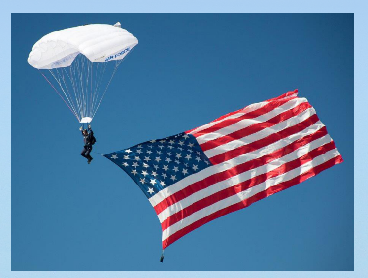
The USAF Wings of Blue Skydiving Team will be returning to Wings Over Wine Country this year.