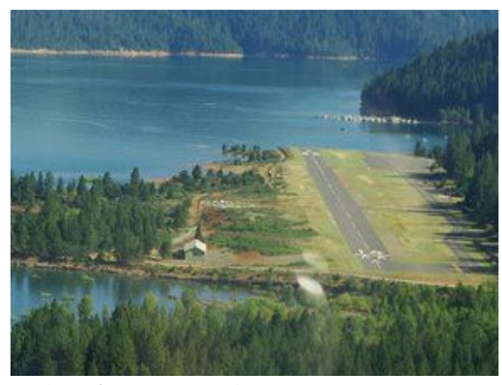
Aerial view of runway on approach

When you make your reservation, let them know that you will need to be picked up at Trinity Center Airport. Then call them the day before your arrival to confirm your ETA.