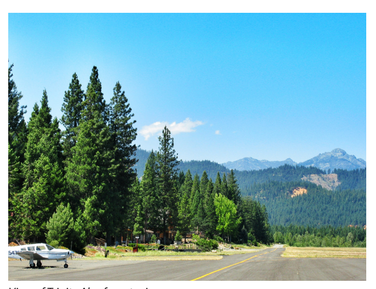
View of Trinity Alps from taxiway

Nestled off the coast of Northern California and deep in the Redwood forest, Sonoma Canopy Tours is high adventure and completely unlike anything you've ever experienced. With two unique courses, each a two-and-a-half hour Guided eco tour that include multiple zip lines, sky bridges, a majestic spiral staircase, a rappel to the forest floor, you will be immersed in the unparalleled beauty of the world famous California Coastal Redwoods. www.sonomacanopytours.com